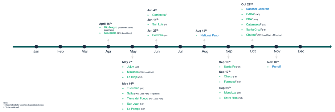
Figure 2: Electoral Calendar 2023